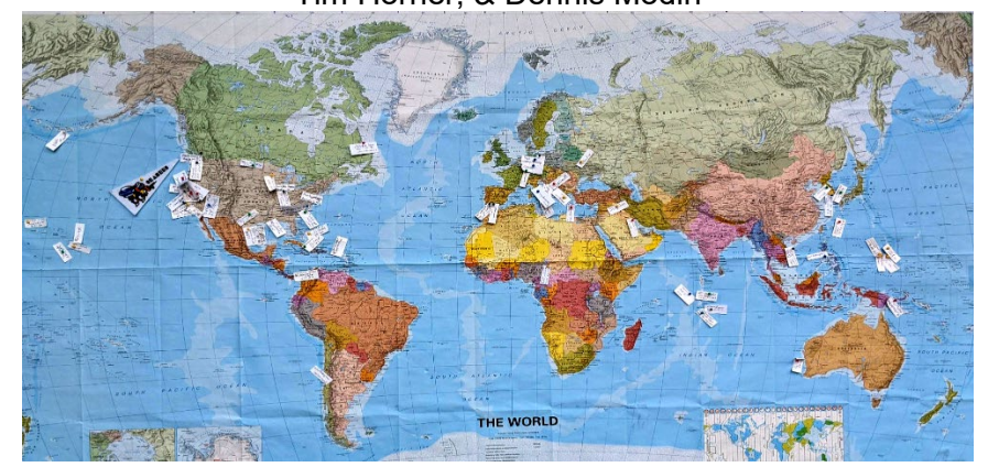
Seabees Stationed Around the World